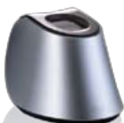
PC Fingerprint Reader